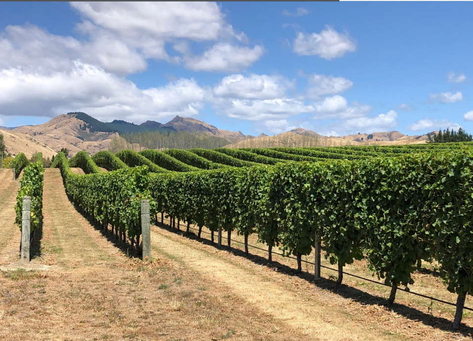
BROOKDALE VINEYARD, SOUTHERN VALLEYS