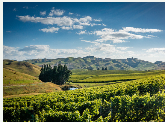
CALROSSIE VINEYARD, AWATERE VALLEY

This vintage will be one to remember for many reasons and when the dust settles, the main one will be the wines.