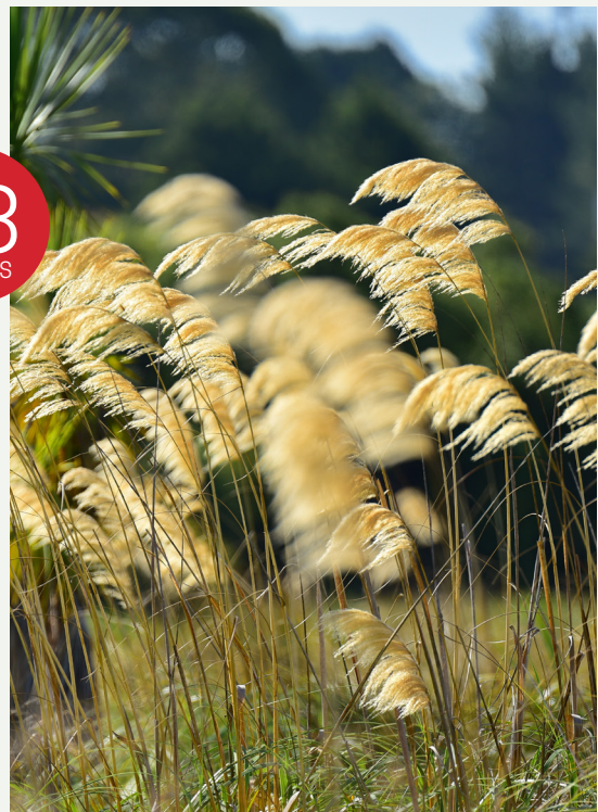
NATIVE TOI TOI