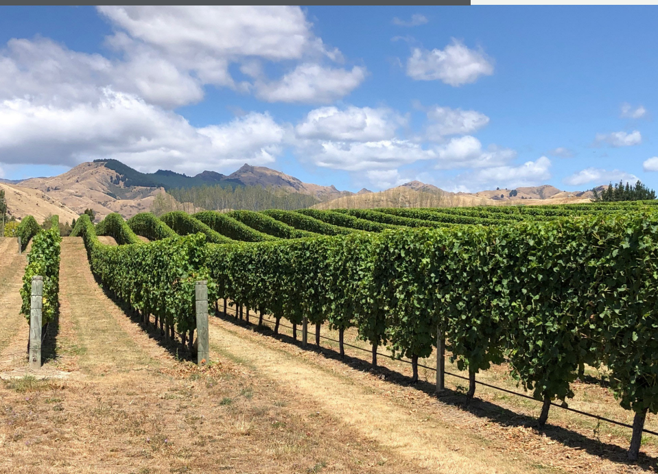
BROOKDALE VINEYARD, SOUTHERN VALLEYS