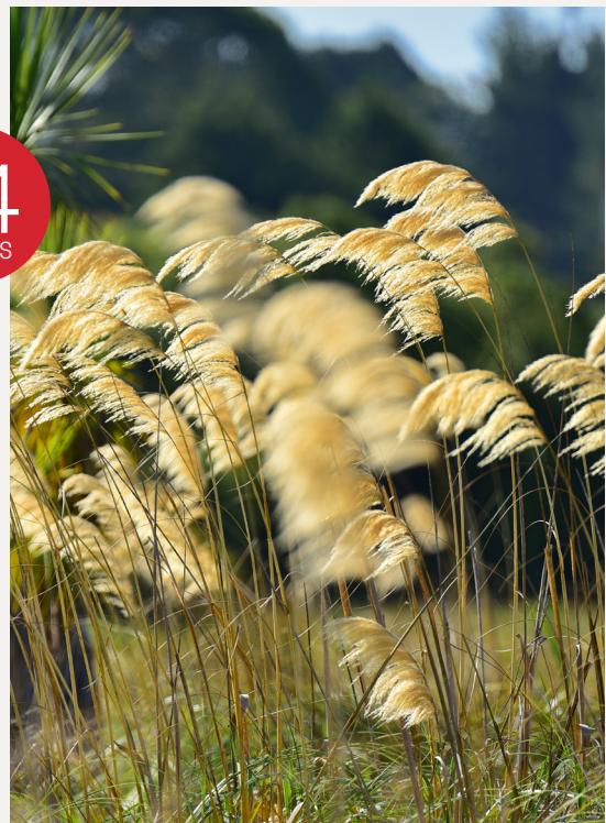
NATIVE TOI TOI