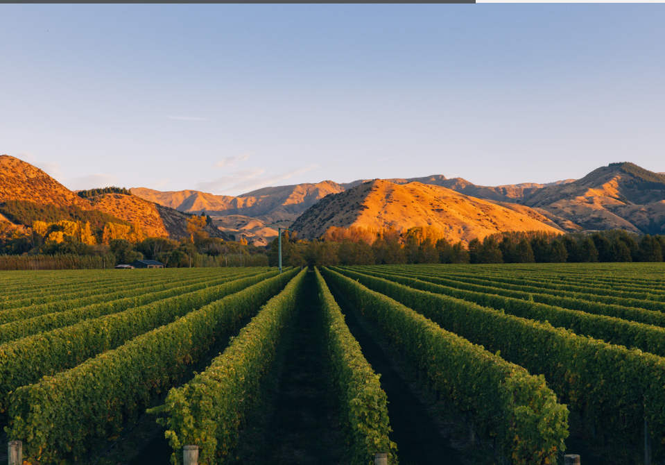
BROOKDALE VINEYARD, SOUTHERN VALLEYS