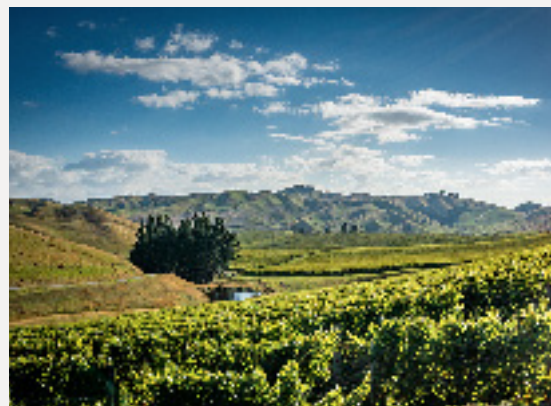
CALROSSIE VINEYARD, AWATERE VALLEY

Cool nights played a crucial role, keeping harmful fungi in check and preserving the grapes' acidity. Those who remained patient experienced fantastic weather in March and April, resulting in grapes with excellent sugar content, vibrant flavors, and balanced acidity across all varieties.